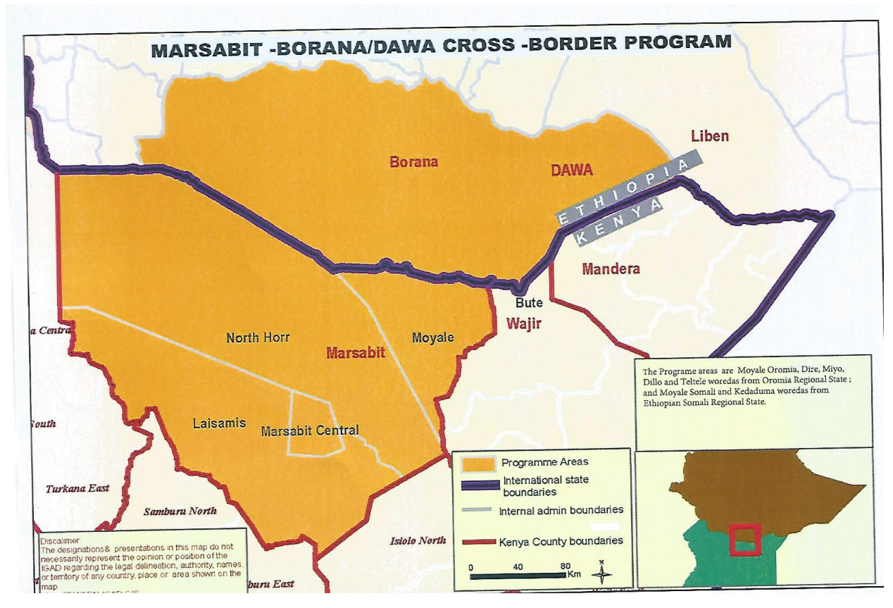
Map 1 - Coverage of the programme area

traverse Marsabit, Turkana, Wajir and Mandera Counties on the Kenyan side, and Borana and Dawa zones on the Ethiopian side. On the Kenyan side, Marsabit County shares a longer bit of the border with Ethiopia, with Borana zone also sharing a long border with Kenya compared to Dawa and Omo zones. Marsabit County is comprised of four sub-counties: Laissamis, Marsabit Central, Moyale and North Horr. On the Ethiopian side, the programme intervention areas comprise Moyale Oromia, Miyo, Dillo, Dire and Teltele Woreda in Borana Zone and Moyale Somalia and Kedeuma Woreda in Dawa Zone. This cross-border area is characterized by poorly developed physical infrastructure, remote from the respective capitals (Nairobi and Addis Ababa), and low school enrolment rates combined with low literacy levels, poor education indicators and high poverty levels. All the development indices in this cross-border area are much lower than the national averages of the respective countries (see tables 1 and 2). The population is largely mobile and their movement is not confined to one country, but transcends international boundaries into Ethiopia and vice versa. These inter-regional and cross-border movements oftentimes lead to conflicts over water and pasture.<sup>2</sup> For coverage of the programme area, please refer to Map 1 below.